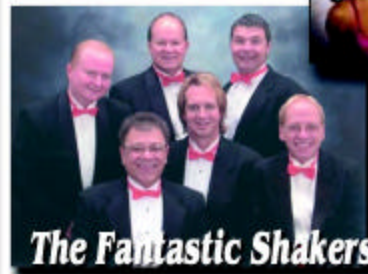
The Fantastic Shakers

For additional information check out our website - www.abscdj.com